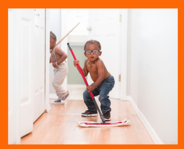
Thank you for Springing into Action!

MCUM began the " Spring into Action " campaign, a community-wide challenge against poverty last month. Our goal is to raise $40,000 to support our programs and to gather an additional 1,000 pounds of cleaning and hygiene items to restock our cleaning and hygiene closet.