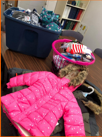
Coats, socks, hats, and other winter items brought in by St. Marks for the kids and families at Compass